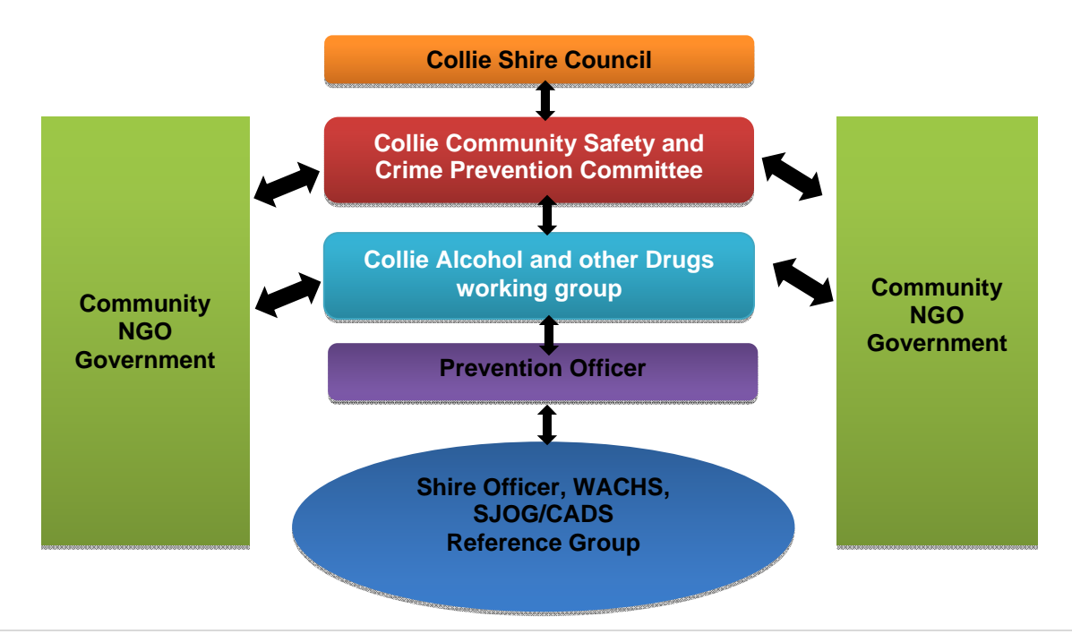
Figure 1: Reporting Pathway

A Memorandum of Agreement between the Shire of Collie, SJOG and WACHS also supports the Project Officer role through the commitment of infra-structure, professional and technical expertise, and support. Terms of Reference guide the administrative and membership operations of the AODMP working group.