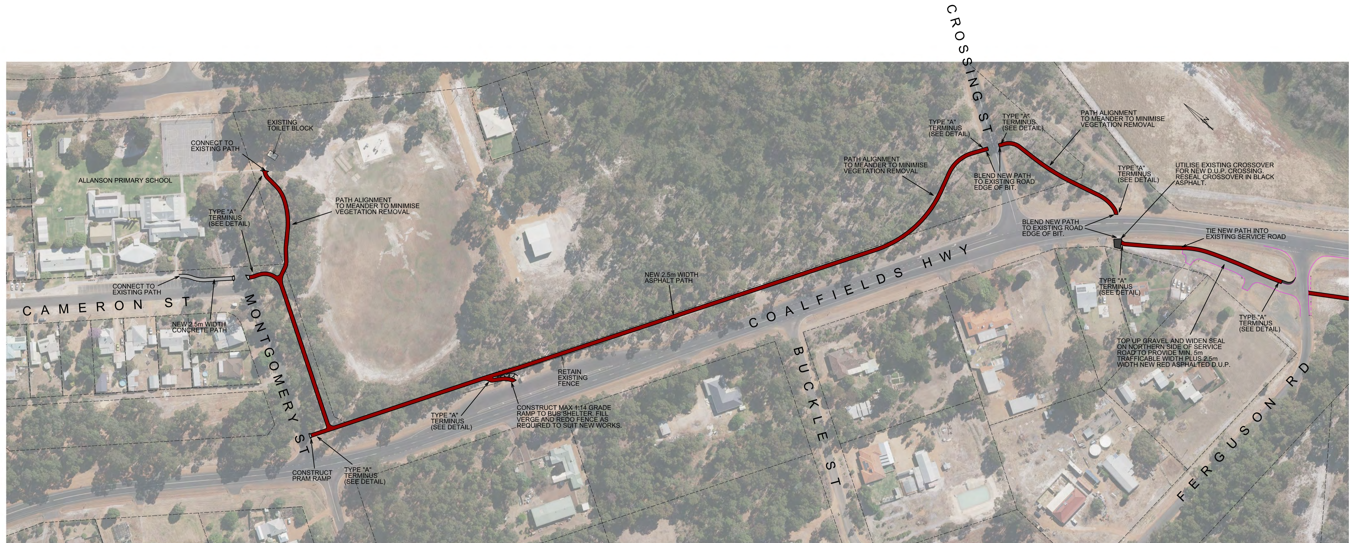
GENERAL LAYOUT SCALE 1:1,250