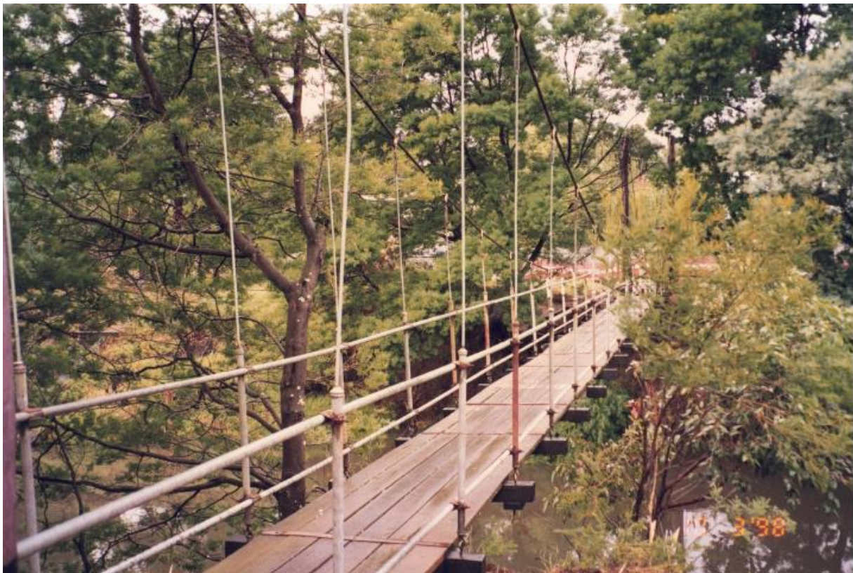
Remedial works 1998

The bridge holds many memories for many people and has a unique place in the Collie community's heritage. It is one of only a few long-standing suspension footbridges in Western Australia.